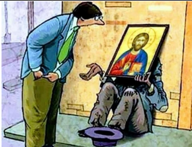
Meatfare/Last Judgment Gospel Lesson in one image!

You love righteousness and hate iniquity.