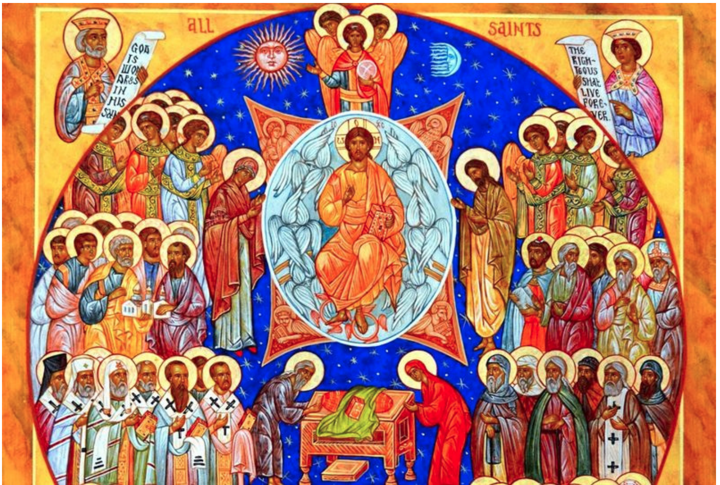
Icon of All Saints—November 1/14