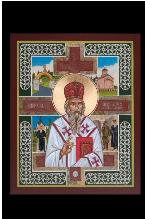
Icon of St. Nikolai Velimirovich