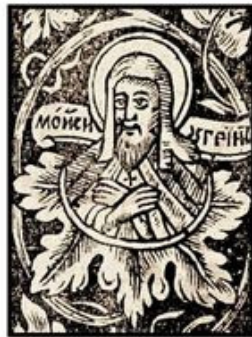
Our Venerable Father Moses the Carpathian of the Caves Lavra

O God, You are our refuge and strength, and a very present help in trouble. (Psalm 46:1) Hear our heartfelt supplication on behalf of the people of the country of Ukraine. Protect those in danger with your holy angels and grant them courage. Turn back all manner of attacks. May hostility fade away. Let Your peace descend upon the whole land, so that the shedding of blood in warfare, violence, terrorism, tyranny, and all manner of strife may come to a swift end. Enlighten all civil authorities around the world with wisdom to diligently work for reconciliation. O Lord of hosts, we have no other help but You in times of distress: quickly hear us now and have mercy!