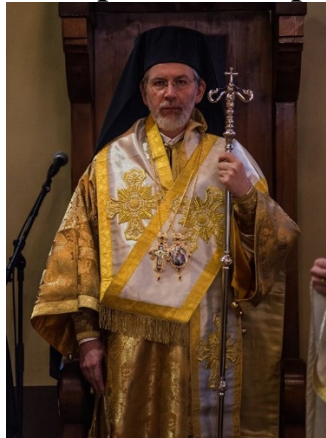
Metropolitan Cleopas of Sweden and All Scandinavia