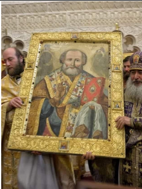
Ancient icon of St. Nicholas the Wonderworker