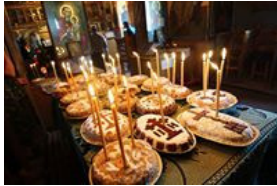
Image: Kollyva (Greek: Κολλυβα, (kólliva); Serbian: кољиво, (koljivo); Romanian: colivă ; Bulgarian: коливо, (kolivo); Ukrainian and Russian: Kutya (or Kutia)) is an offering of boiled wheat that is blessed liturgically in connection with the Memorial Services in Church for the benefit of one's departed, thereby offering unto God, as it were, a sacrifice of propitiation (atonement) for the dead person, and in honor of the Sovereign Lord over life and death. (wiki)

Celebrating today, Lord, the memorial of all who from the beginning have died in the true faith, we cry fervently to Thee: Give rest to them all with Thy sants. (Triodion)