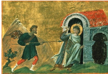
Menologium of Basil II, ca. 1000

But in addition to the normal imperial duties of managing and protecting the city, the emperor commanded Demetrios to eradicate Christianity in the city and execute anyone who called on the name of Christ. Demetrios accepted the appointment as proconsul, but instead of carrying out the emperor's command, he returned to Thessalonica and publicly confessed his Christian faith, proclaiming the Gospel to all that would listen. Upon learning that Demetrios was a Christian and that he had converted many to the faith, the emperor ordered his arrest.