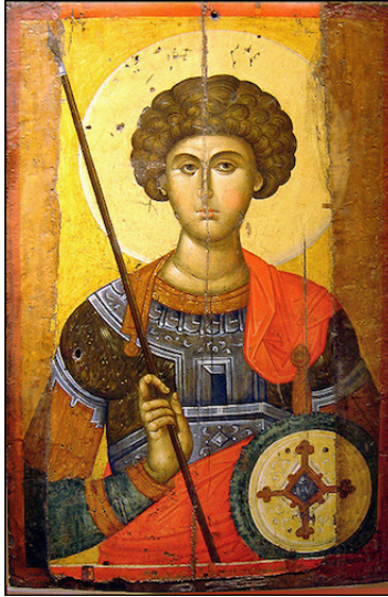
Above Icon: St. George the Wonderworker