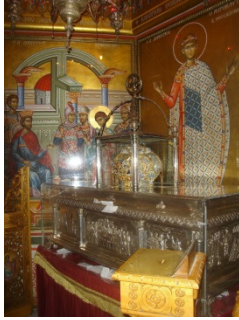
Relics of St. Demetrios, Hagios Demetrios, Thessaloniki

So today is not a day for excuses. It is a day to bring the love of Christ into the world. Smell the air, right here in the chapel. Do you smell the sweet aroma of myrrh? It is not unlike the myrrh that streams from the tomb of St. Demetrius. It is the wonderful aromatic reminder we have on our clothes every time we return home from Church.