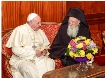
Photo Caption: Ecumenical Patriarch Bartholomew with Pope Francis, in the Patriarchal office in Phanar during the Pope's visit to the Ecumenical Patriarchate for the Thronal Feast of Saint Andrew the Apostle, Nov. 29-30, 2014

NEW YORK – TIME magazine website published today an exclusive article outlining the response of His All-Holiness Ecumenical Patriarch Bartholomew to the Climate Encyclical Letter of Pope Francis Laudato Si' , presented this morning at the Vatican.