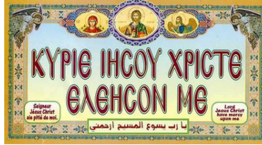
The Jesus Prayer: an image from Balamand Monastery

“Thus prayer does not tire but invigorates. It is tiresome only when we do not enter into its meaning and do not understand the sense given it by our Holy Fathers. Once we comprehend the need of God’s mercy, the desire of this hunger will compel us, without pressuring ourselves in prayer, to open our mouth like a nursing infant, and we will feel, simultaneously, all the security and joy of a baby in its mother’s embrace.” Elder Paisios of the Holy Mountain, Athos