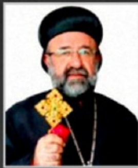
Mar Gregorios Yohanna (Ibrahim) Syriac Archdiocese of Aleppo