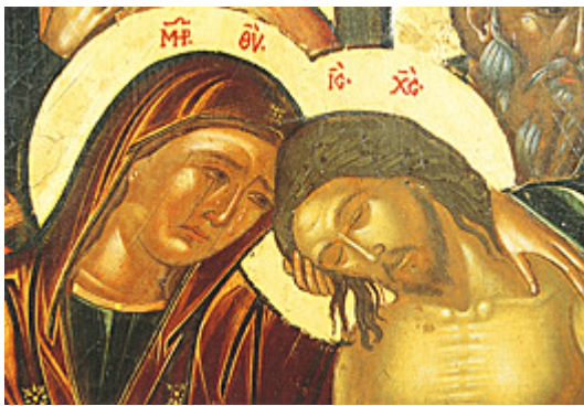
Deposition from the Cross (Detail) – CF873

++Greetings for Holy Week, Pascha, and Beyond++ "...for God is love." (I John 4:8)