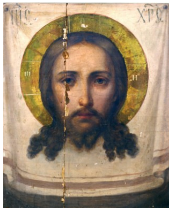
Made without Hands (Holy Napkin) - 19th c. Russian, Platina - (11R12)

Years ago, I first saw an icon of the Holy Mandilion on the cover of the book Orthodox Dogmatic Theology published by St. Herman Press. I was deeply moved by its beauty and desired a copy of that same icon. I will share with you that I now do have a copy of that lovely icon—it revealed itself to me on a shelf at a local thrift store a couple months ago. I treasure it!